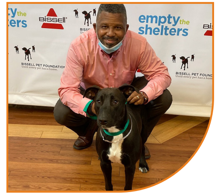
Barkley and his new poppa!

4918 Preston Highway Louisville, KY 40213 (502) 636-3491