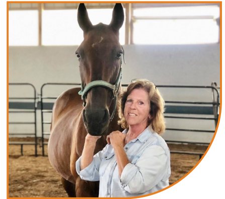
Happy trails, Hoss!