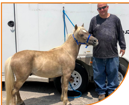
Sassy Finn is ready to go home!

George, a senior Persian, got scooped up after being on the adoption floor for less than a day. He has two Persian kitty siblings to play with and a mom who adores him. George stole all of our hearts at KHS and we are thrilled he found a home with an experienced owner who will keep up with his grooming needs. Congratulations, George!