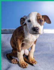
Cover photo of Pie by Jennifer Schoenegge, jenniferschoenegge.com