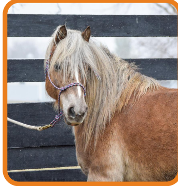
Gracie was adopted! Her new family got a very cool pony!