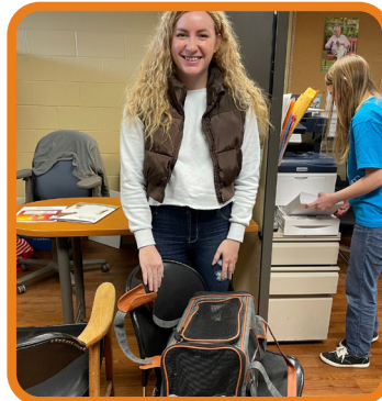
Our sweet and goofy cat Salem has found his furever family!