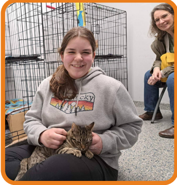
Our adorable kitty Visby has been adopted by a purrfect family!