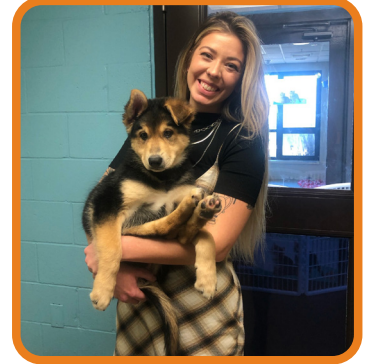
Coventry has gone home! We wish her new pawrents nothing but love!