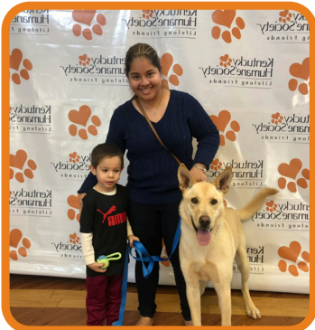
Sweet Tapatio has found his fur-ever home! Congratulations!