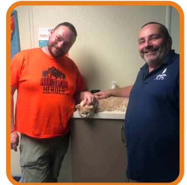
Beans has been adopted and we couldn't be more purr-oud!