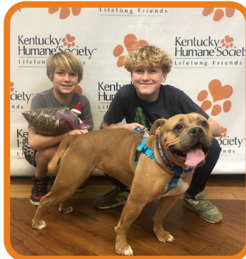
Cookies has been adopted! We are thrilled for our wiggly happy girl!