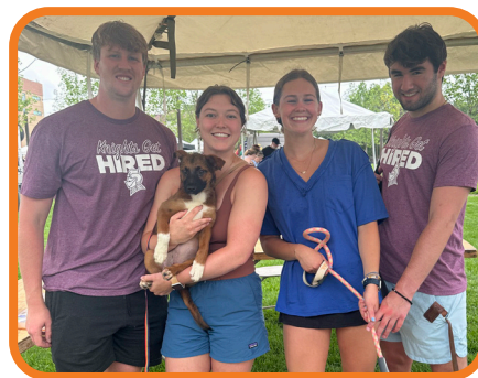
Crouton's adopter was waiting at the door to meet her during our 30th annual Waggin' Tail on the Waterfront. She's one lucky girl!