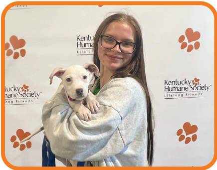
Bagel Bite was one of over 150 dogs who found her new family at Hammer's Lou Adopts. Congrats!