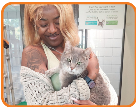
Sassy was adopted during a BISSELL Empty the Shelters event. Best wishes for Sassy and her new family!