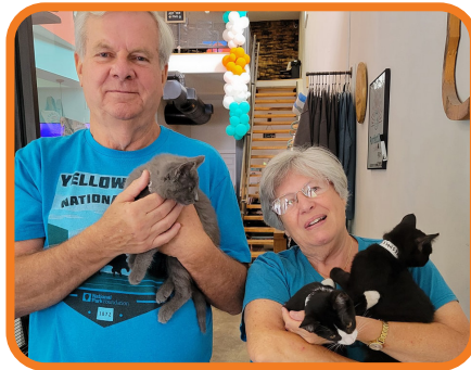
Meow-WOW! Jellybean, Sheep and El Yucateco all found their new family at Purrfect Day Cafe.