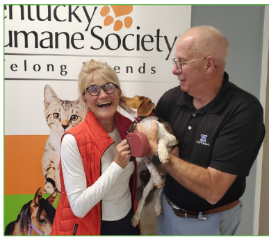
Chip stole the hearts of this lovely duo and is happily enjoying his forever home. Happy tails, Chip!