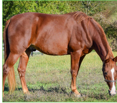
Deke was adopted by one of our amazing Equine volunteers, and he is so happy to begin his new chapter!