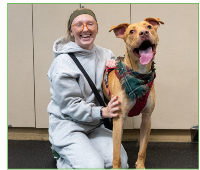
After spending over 200 days in the shelter, Dandy finally found his forever home. Happy Tails, Dandy boy!