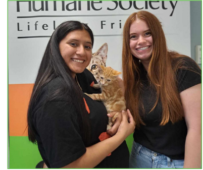
Dorito, the cheesiest companion, found his purrfect match over at East Campus. How fur-tastic!