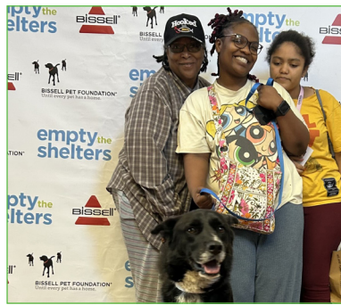
Murray was so excited to find a home during BISSELL'S Empty the Shelters event!