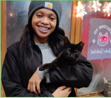
Hopper was adopted from the Purrfect Day Cafe. Con-CAT-ulations, Hopper!