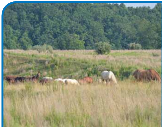
Free roaming horses run loose in Perry County.