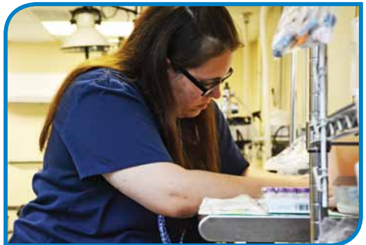
The ASPCA funds a part-time veterinary assistant position.